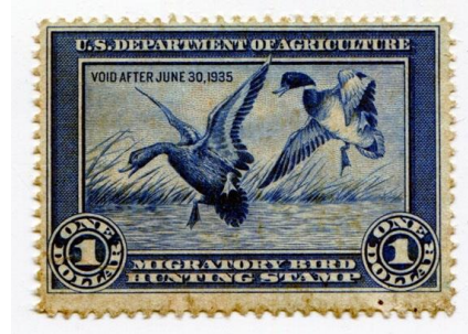
The first Stamp: 1934-5

But by 1938-1939 that threshold was surpassed, and there would be no turning back. With the new U.S. Fish and Wildlife Service created in June 1940, stamp authority was transferred to the Department of the Interior to buy or lease wetland habitat.