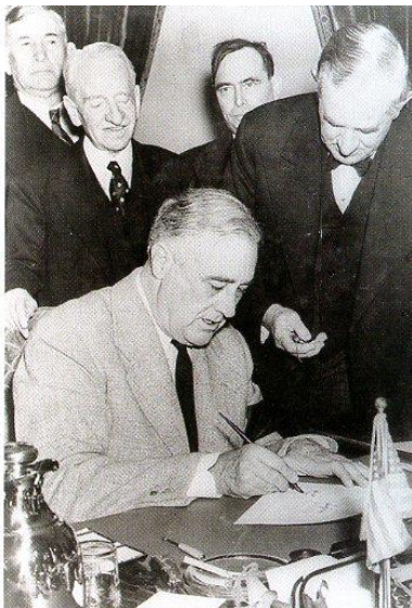
FDR signing in 1934

The new bill passed 10 months later and was signed into law by President Roosevelt on March 16, 1934. With Roosevelt's signing of the Migratory Bird Hunting Stamp Act, popularly known as the Duck Stamp Act, funds from stamp sales would be deposited in a special treasury account, the Migratory Bird Conservation Fund (MBCF). With this innovation, the MBCC was finally provided the means to carry out meaningful wetland and bird conservation.