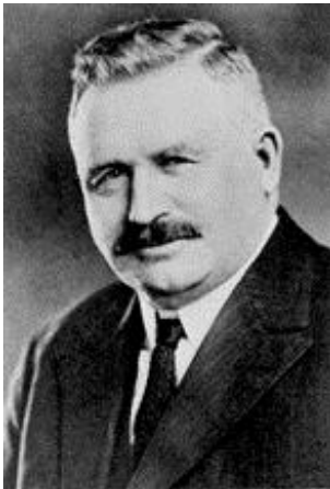
Senator Peter Norbeck (R-SD)

With the 69th Congress, Senator Peter Norbeck (R-SD) championed a revived conservation effort, but his bill eventually had the federal license portion stripped from its content. What ultimately passed - the Migratory Bird Conservation Act of 1929 - had a number of important elements (including the creation of a Migratory Bird Conservation Commission), but it had no reliable funding mechanism. Under the existing 1929 Act, only unlikely annual federal appropriations could sustain MBCC acquisition decisions.