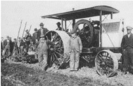
Mechanization on the Prairies

The start of the 20th century saw a rapid increase in this country's agricultural productivity. If anything, the American entry into WW I accelerated this trend, with agricultural mechanization and wetland draining rapidly spreading across the U.S., especially through the Great Plains. This produced an abundant harvest of needed crops, but it also created an impoverished natural landscape. The trend continued after the war and into the 1920s, with devastating wetland consequences. The use of more powerful ammunition, rapid-fire guns, lenient bag limits, and practices like baiting and the use of live decoys in waterfowling only exacerbated the