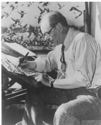
The first Federal Duck Stamp was sketched in 1934 by Jay N. "Ding" Darling, who worked for the Des Moines Register. Darling, who twice won the Pulitzer Prize, died 50 years ago.