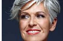
88 Year Old Yoga Teacher Shares Her ... Health 1st