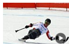
Paralympians to watch in