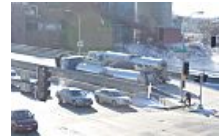
Semi Overturned on Bridge