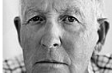
'Warren Buffett Indicator' Signals Coll... Moneynews