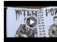
Trailer: 'Water & Power' (0m47s)