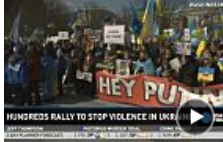
Ukrainian Americans protest violence in Ukra... Mar 7, 2014