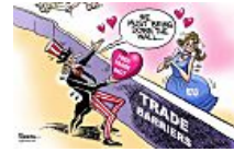
Editorial Cartoons - Feb. 17