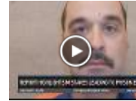
Convicted killer's escape aided by a Super Bowl... (2m23s)