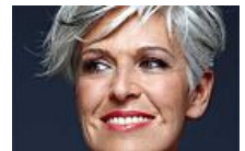
88 Year Old Yoga Teacher Shares Her... Health 1st