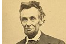
You Won't Believe Who's Related to Abr... Ancestry.com