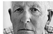
'Warren Buffett Indicator' Signals C... Moneynews