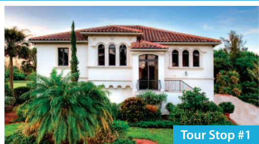
Tour Stop #1

For more information, visit www.marvoentertainmentgroup.com or e-mail sam@marvoentertainmentgroup.com . ✨