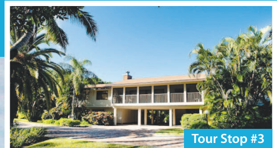
Tour Stop #3

The tour starts at 1316 Eagle Run Dr. where you're invited to have coffee and pastries from 9am to 9:30. Your welcome to join a tour in progress anywhere in the schedule, times are exact so that you can schedule your day.