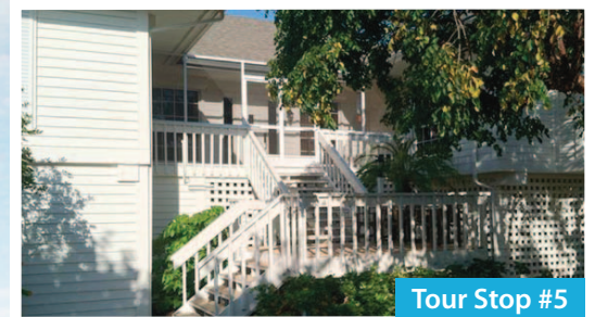
Tour Stop #5

303 Periwinkle Way, Snug Harbor D - 10:15am to 10:30am