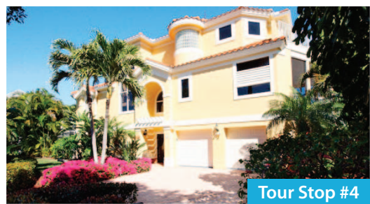
Tour Stop #4