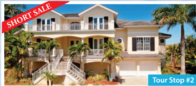
Tour Stop #2