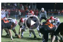
H.S. Football Insider - Week of 10/15/12