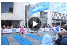
Des Moines Marathon 2012