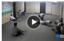
Caught on camera: Student wrapped in rug...