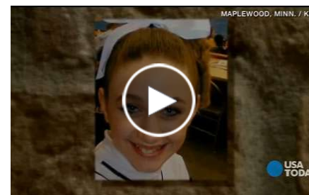
Teen with brain injury gets help after story airs on TV Oct. 22, 2012