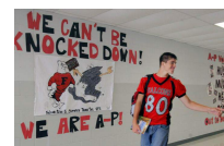
A town comes together