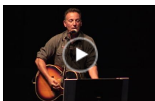
Forward and Away we Go - Bruce Springsteen at I...