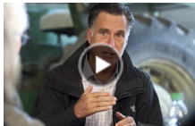
(AUDIO only) Mitt Romney on women's ri...