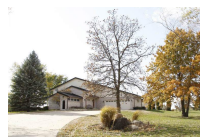
Inside the Wasendorf estate auction