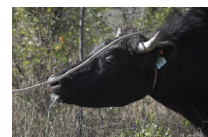
Escaped Bull in Des Moines