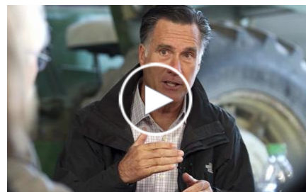
(AUDIO only) Mitt Romney on women's rights Oct. 10, 2012